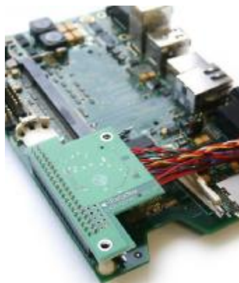
LVDS Converter installed on Orchid