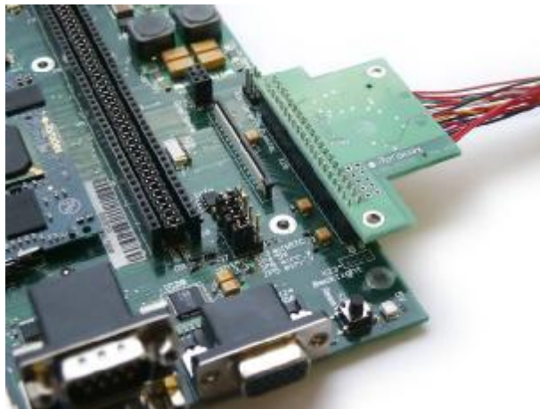
LVDS Converter installed on the Colibri Evaluation Board

For the installation of the LVDS Converter on Colibri Evaluation Board or on Orchid be cautious to match the Pin 1 indicators of both connectors.